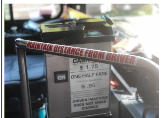
Photos: Shoreline Metro bus with a new customer notice decal on handrail.

2020 threw curveballs, screwballs and blazing fast balls. But with each pitch, someone was always at the plate ready to swing for the fences. Safety came to the forefront and was the focus on daily operations. In 2020, safer and more convenient fares and fare media were introduced. (Continued on the back side.)